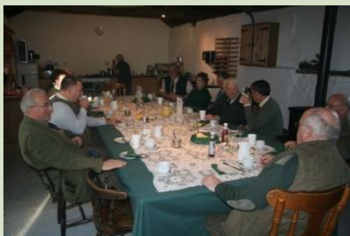
Breakfast before a shoot

A very welcome addition to the range of meals we offer has been the full English breakfast - great value at only £5 per head. The hearty meal sets you up well for the day and is especially good now we're getting to the colder months. Breakfasts are offered as an optional extra to anyone who has booked a day for a full team - if you would like to offer this to your team, please let us know and we'll make the appropriate arrangements.