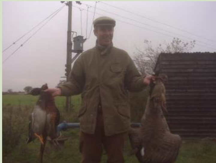
5 species in one drive

We've always said that we offer real variety and this was well illustrated last week when the line bagged 5 species on one drive - pheasant, partridge, duck, goose and pigeon. As you can see from the picture, the chaps were delighted.