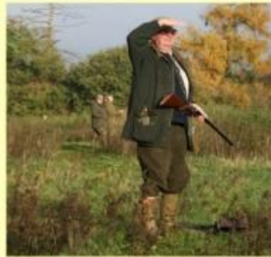
Hammer Gun Day